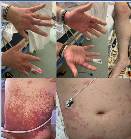
Figure 1: Rash involving hands, including palms, legs, back, and abdomen demonstrating targetoid lesions